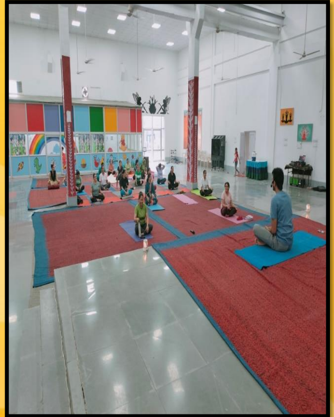
AMOGH WOMEN YOGA SESSION AT AEC