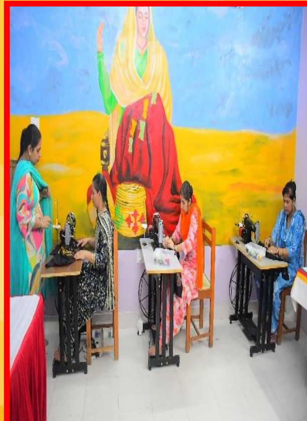
EMBROIDERY CLASSES AT AEC