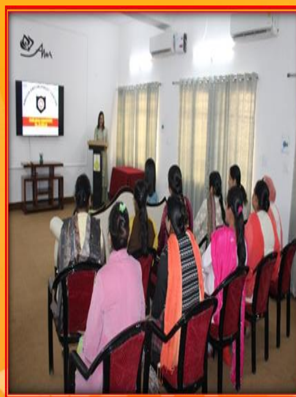
CERT DISTR OF HANDMADE EMBROIDERY CLASS AT AEC