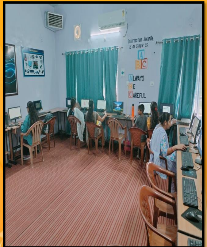
AMOGH WOMEN COMPUTER COURSE AT DIGITAL LAB AT AEC