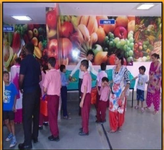
VISIT TO VEGETABLE SHOP