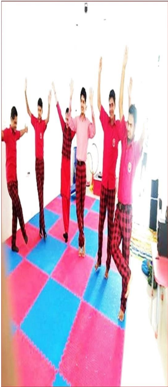
LEARNING THROUGH MUSIC CLASSES