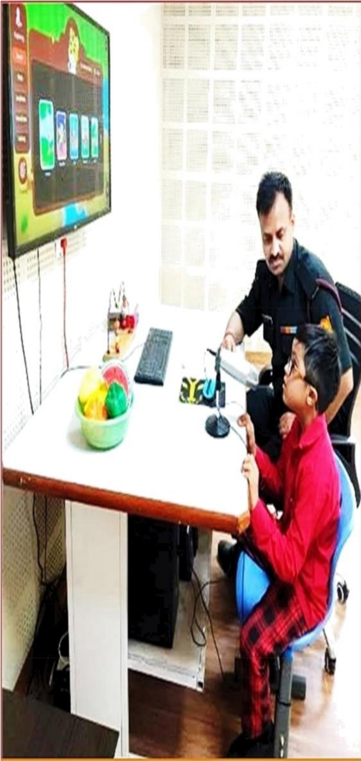
SEEFT3BY ¥T3 #RSEEH #OF1ARE