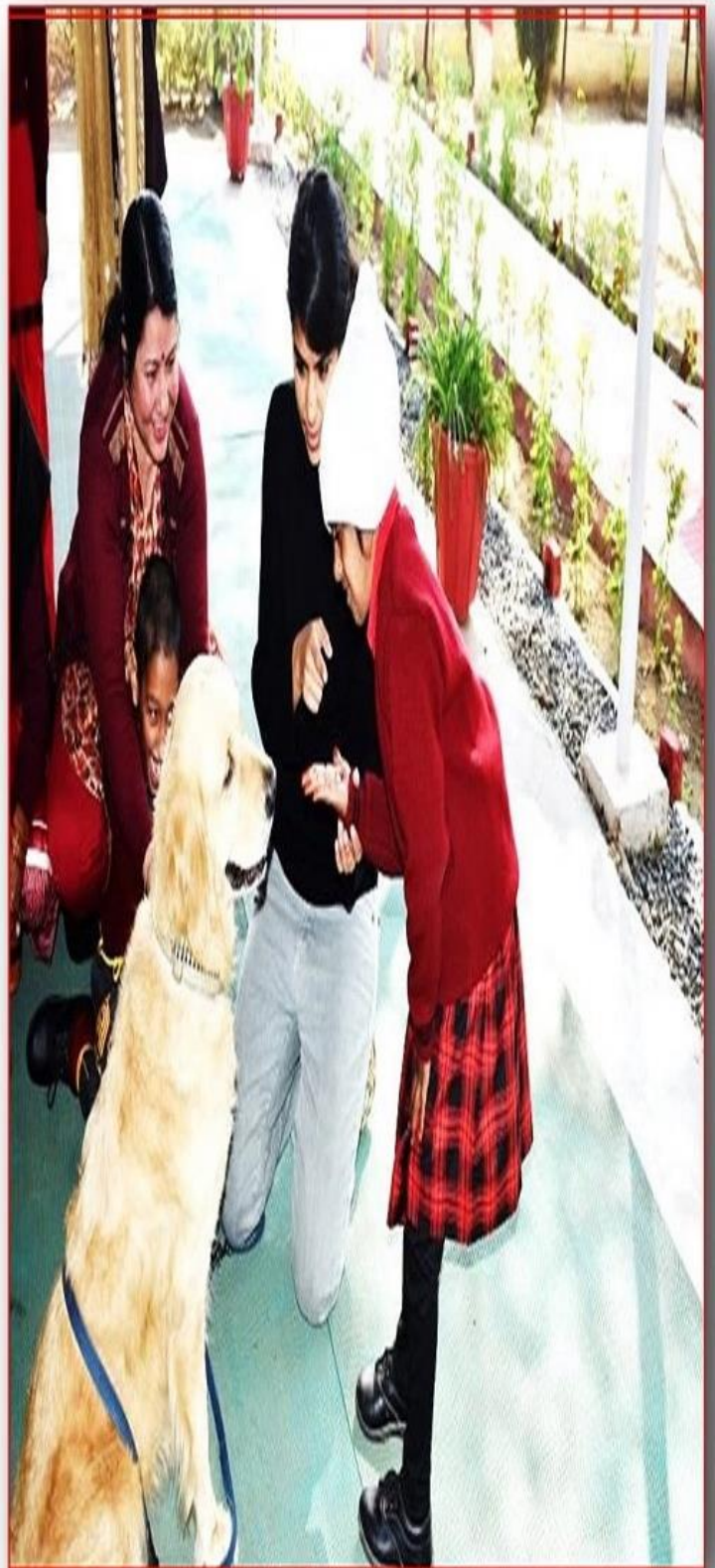
ANIMAL ASSISTED THERAPY