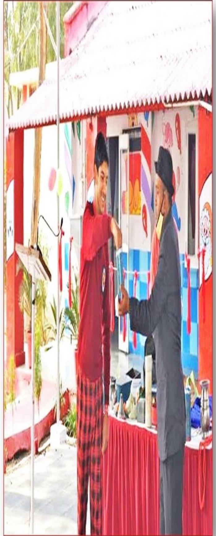
CHRISTMAS DAY CELEBRATIONS