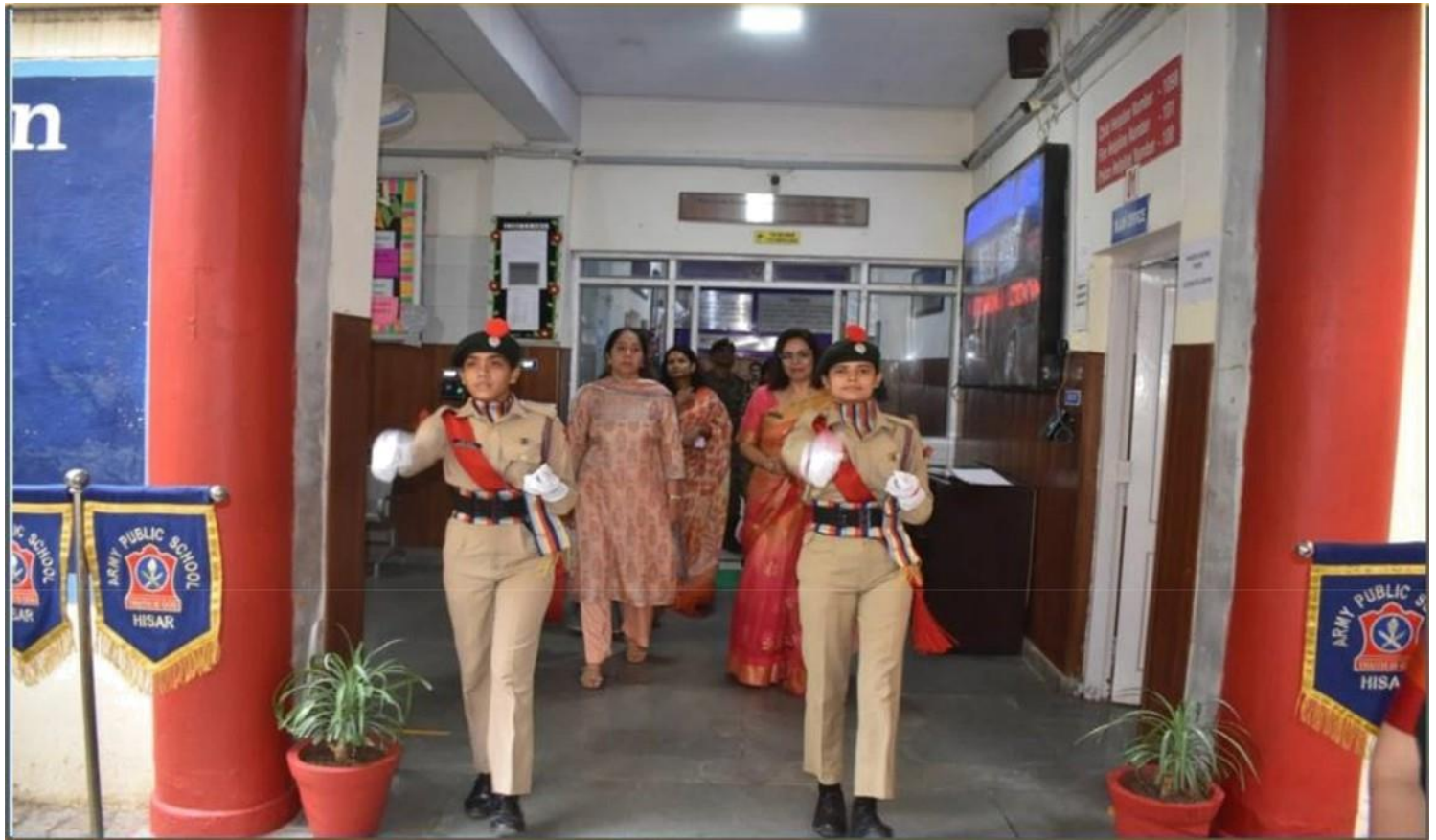
REGIONAL PRESIDENT AWWA VIS ARMY PUBLIC SCHOOL HISAR ON 28 AUG 2024