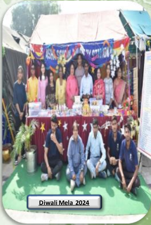
Diwali Mela 2024