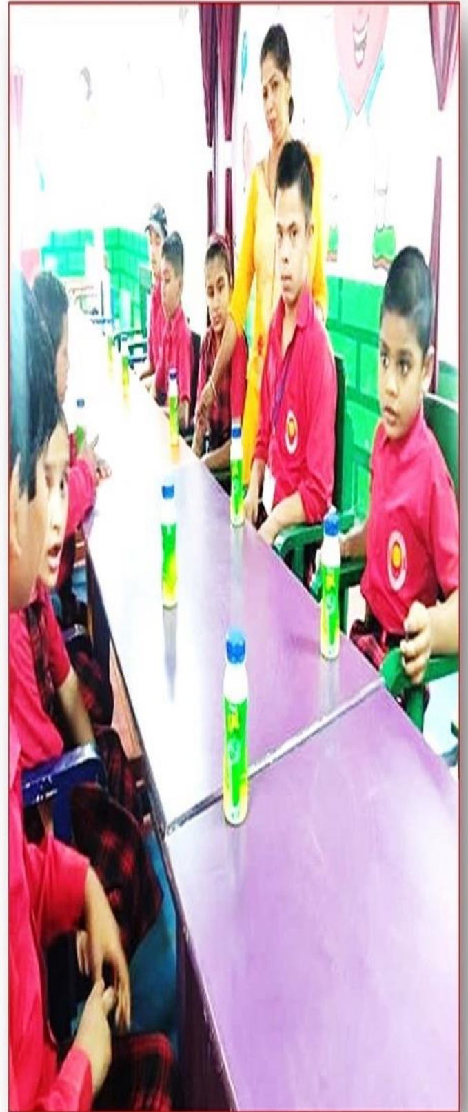
MIDDAY MEAL AT DINING HALL