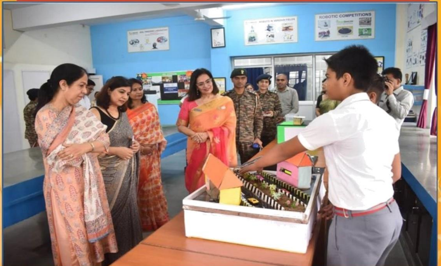
REGIONAL PRESIDENT AWWA VIS ARMY PUBLIC SCHOOL HISAR ON 28 AUG 2024