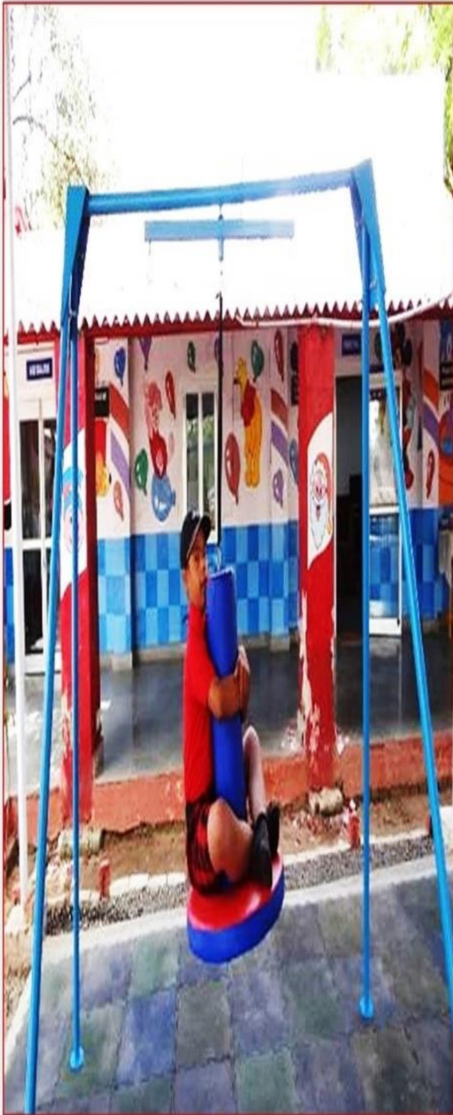
SWINGS WITH STAND