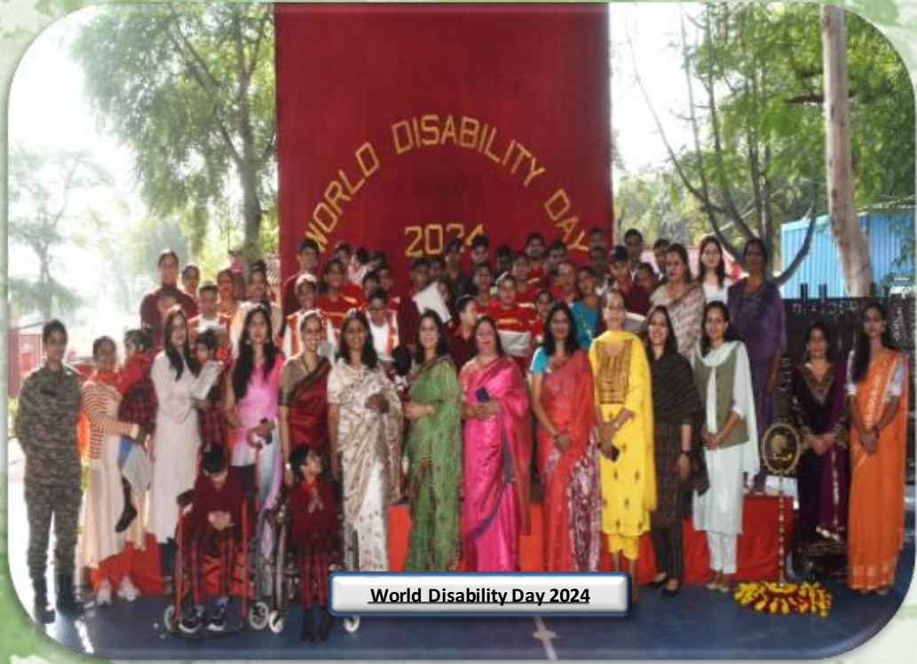
World Disability Day 2024