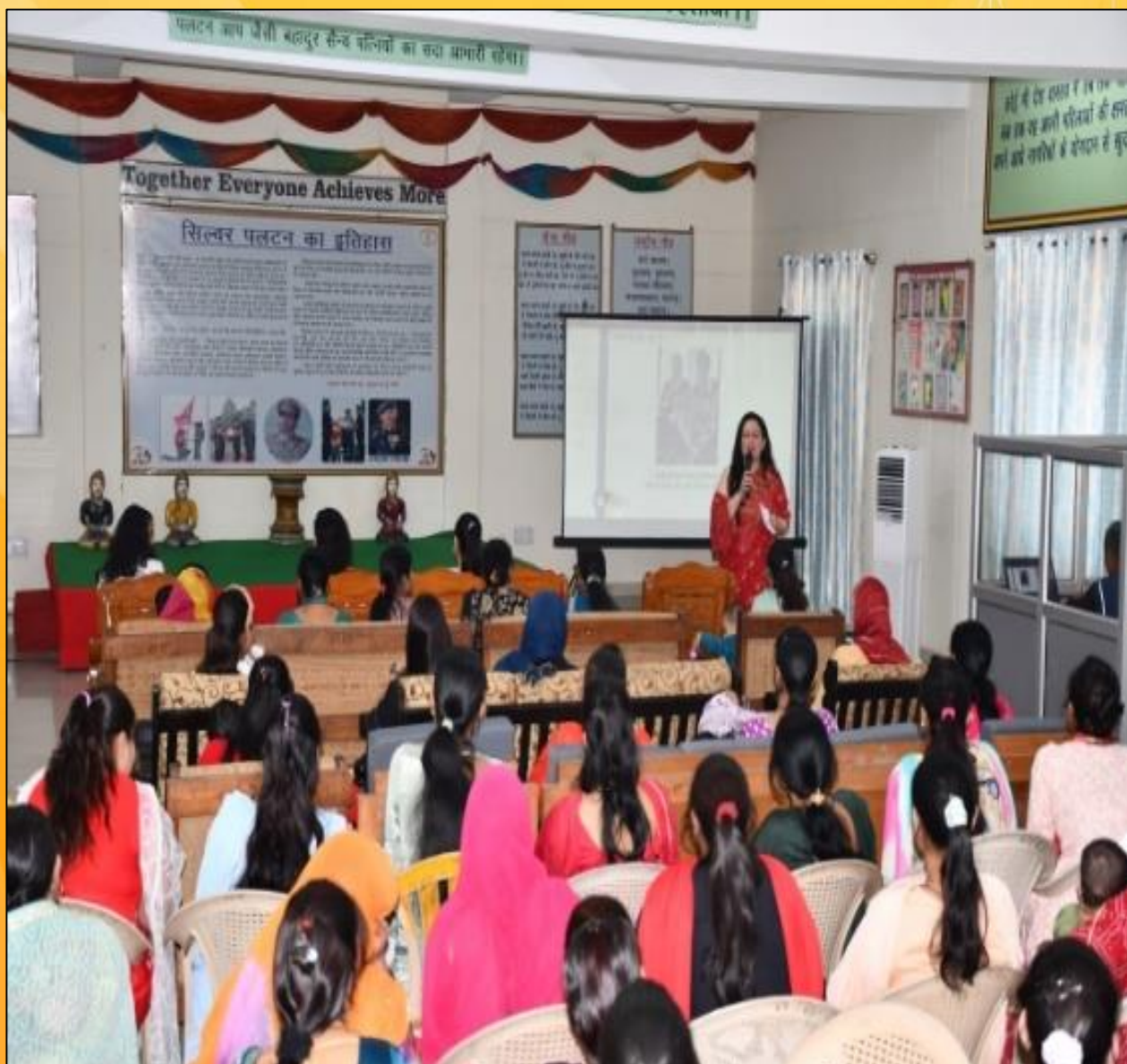
COUNSELING SESSION ON MENTAL HEALTH AND WELLBEING