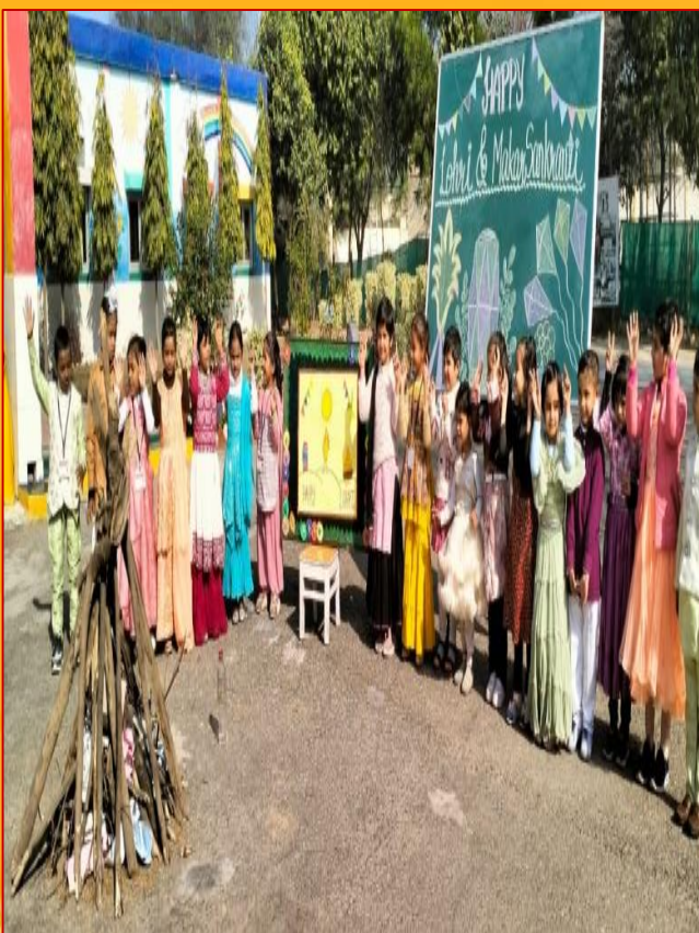
CELEBRATION OF LOHARI & MAKAR SANKRANTI