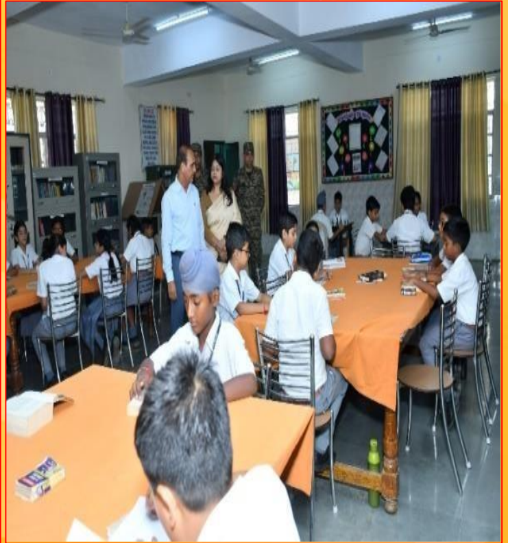
Visit by Director Army Welfare Education Society, HQ SWC at APS