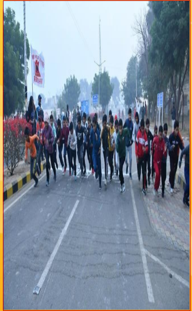
FIT INDIA-CYCLOTHON & MARATHON