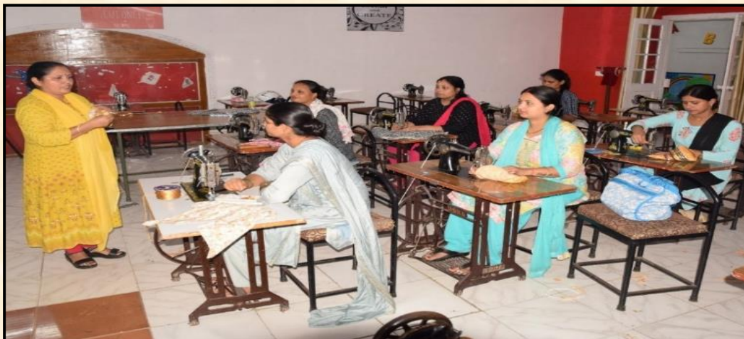
Bag Making Course at VTC, Jabalpur