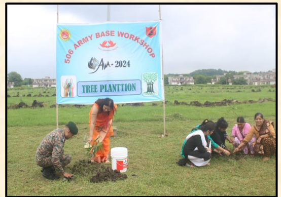
TREE PLANTATION DRIVE' ON 20 AUG 2024

3. Planting in Jabalpur Cantt- Planting was carried out in all the RWAs under the aegis of HQ MB Area in which all residential enclaves were planted by the resident ladies. The drive gave participating planters a different perspective on