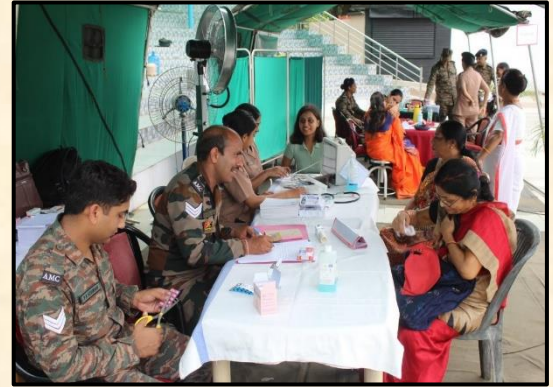
VEER NARI AND WIDOWS MED HEALTH CAMP HELD ON 16 AUG 2024

3. Outreach Initiatives. As a run up to the Veer Nari samellan a number of outreach programs were organised in various stns under MB Area. Outreach pgmes were organised in Siddhi, Satna apart from Jabalpur. A medical camp, ECHS grievance cell, Pension grievance cell was est. 'Veer Nari folders ad After Me folders were also updated for the attendees. at Satna Distt on 29 Aug 24 under the aegis of HQ MB Area. Team of JAK RRC installed SPARSH, ECHS and Grievance Management Help desk for assistance to VEER NARIS, WIDOWS, ESM and their dependents. Total 270 ESM, Veer Naris and widows attended the event. Total 65 grievances were recd out of which 40 were resolved on the spot and rest 25 has already fwd to concerned record office under supervision & monitoring of JAK RIF Record Office. Besides this, med camp was also org for the attendees where Eye spl, med spl and Gynecologist of Distt Hosp, Satna was present to provide med treatment at rally site.