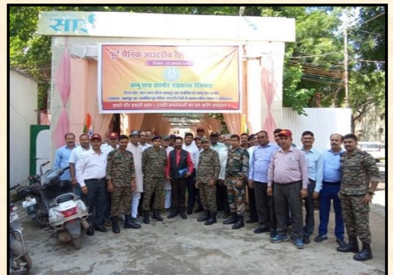
VEER NARI AND WIDOWS OUTREACH PROGRAM: SIDDHI & SATNA