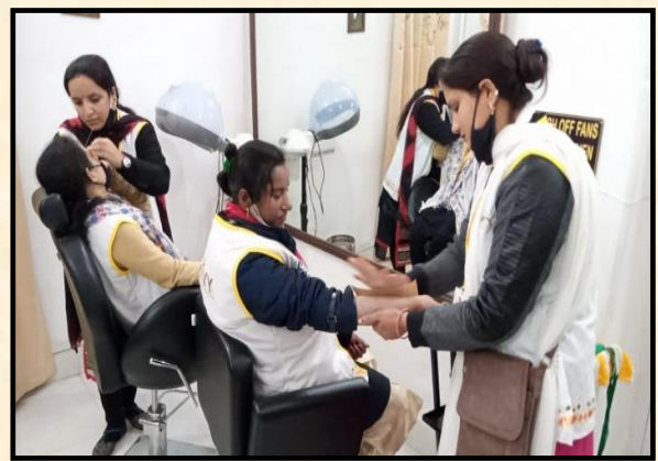
Asst Beauty Therapist