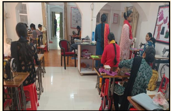
Self Employed Tailor