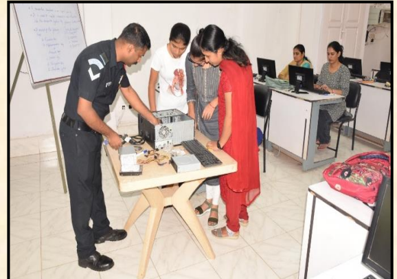
Classes run at VTC, Jabalpur